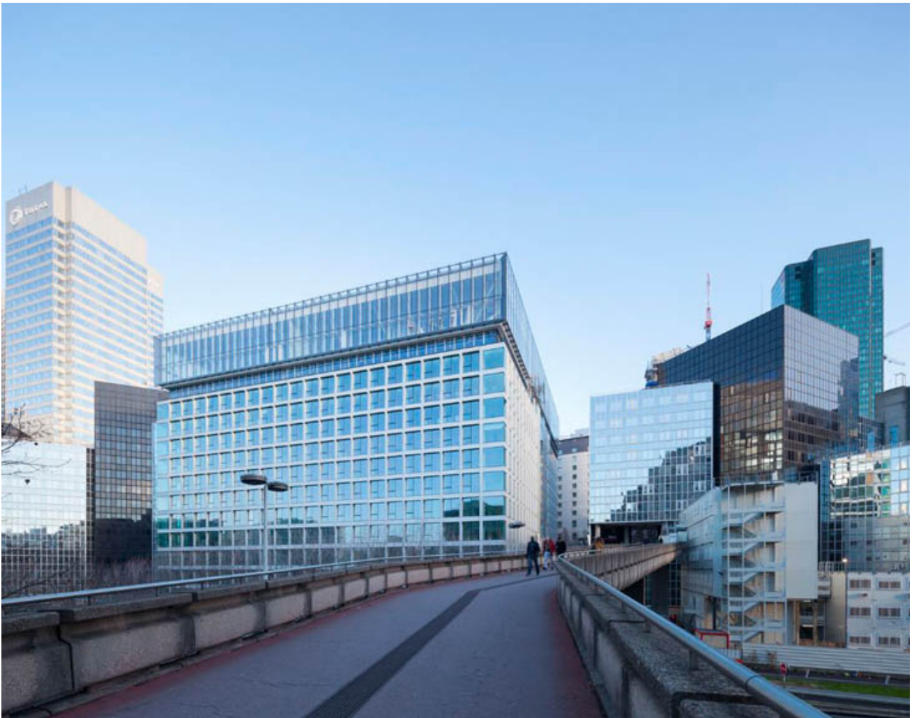
( https://www.bmiaa.com/wp-content/uploads/2019/05/CARRE-MICHELET.jpg ) Carré Michelet © Cro&Co Architecture